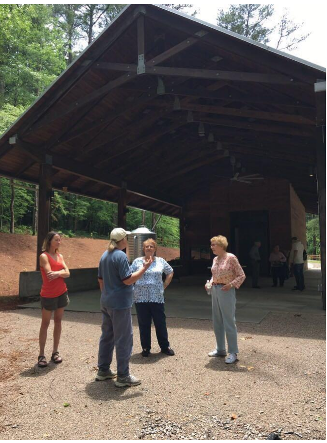
Turkey Creek AAA Trip - 6-9-21